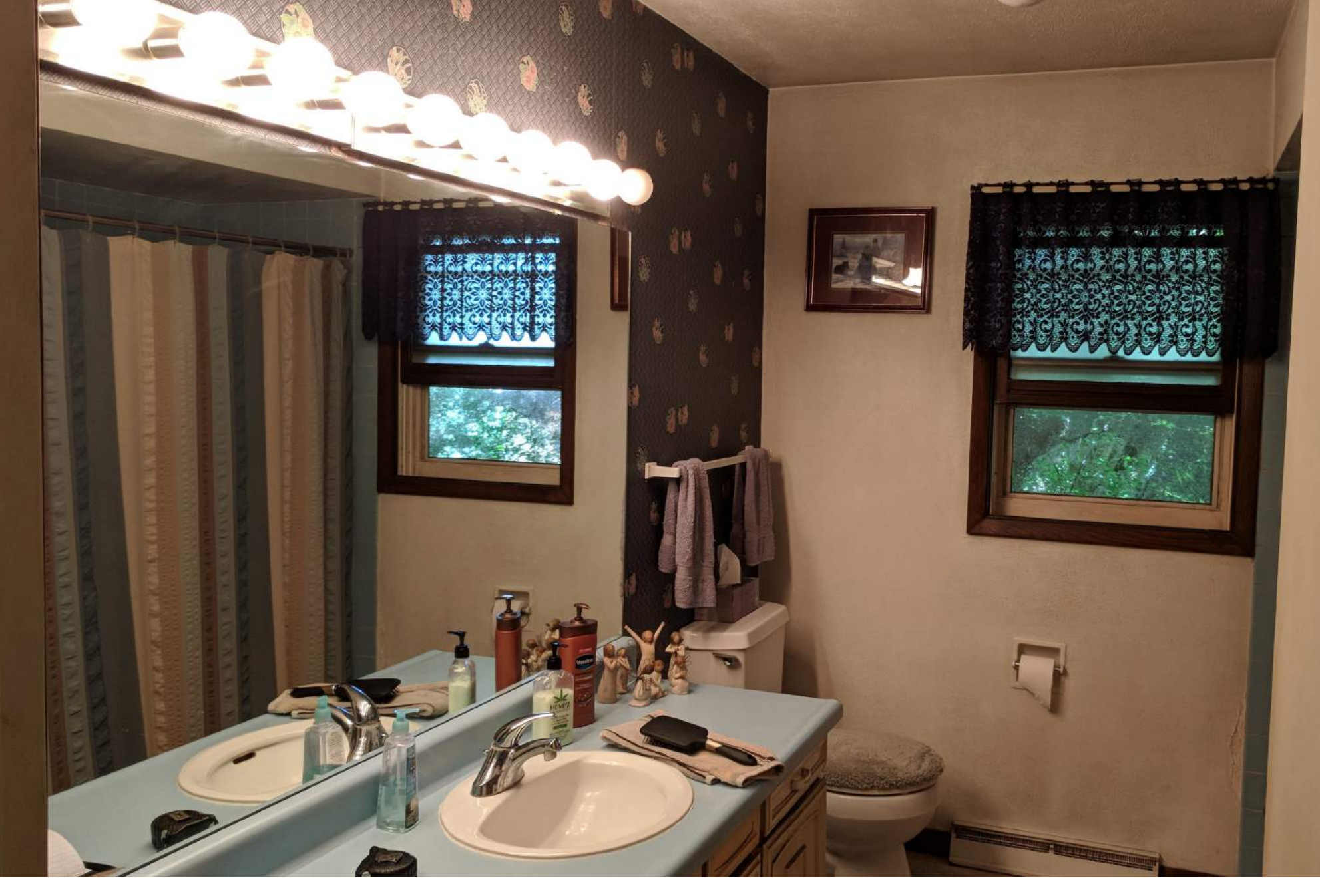
BEFORE: DARK WALLPAPER, DARK TRIM AND CASING, A DIFFICULT TO CLEAN DROP-IN SINK, AND A LEAKING TOILET MADE THIS ROOM AN UNDESIRABLE LOCATION.