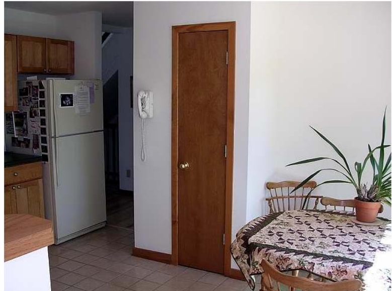
Before: The refrigerator was confined against the adjacent pantry closet wall.

Although the house is less than ten years old, the clients felt confined by the original owners' kitchen. First, the refrigerator opened against an adjacent wall, and a small closet did not function well as a pantry. Second, the kitchen had some unused space, too small for a dinette table and without an eat-in breakfast bar. Third, the laminate counter tops were not longer acceptable in color or style, the cabinets were attractive and in good condition, and to replace them would have been wasteful since the basic layout of the sink and cook top work well. Finally, dreary track lighting left unacceptable shadows in the work areas.