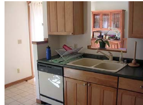
Before: The counter tops and tile floor did not meet the clients design ideals.

We were able to address all the problems within the clients' budget, allowing them to replace the tile with wood flooring to complete the main level of the house.