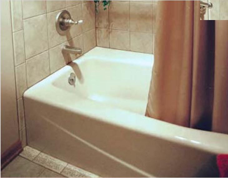
Detail of listello tile at the floor.

A new soaking tub with satin nickel fixtures and luxurious (but standard) tile was installed. A new, inspired vanity design includes an entablature (all built from simple, standard cabinet components), while dimmable rope lighting and sconces surround an inexpensive elliptical mirrored medicine cabinet (purchased by the owner at a home store).