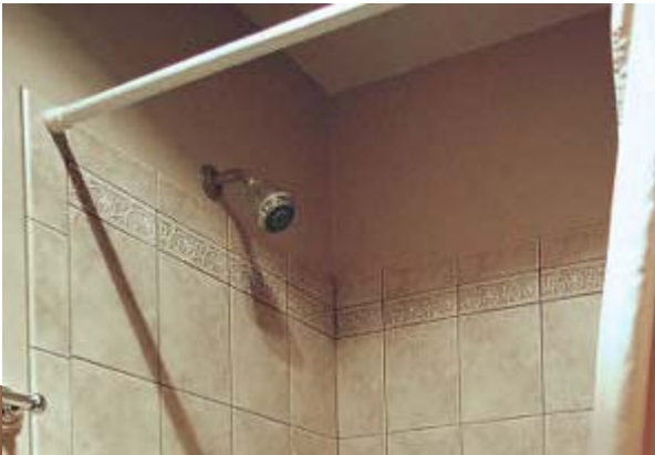
Detail of wall tile and listello with dramatic shadow lines.