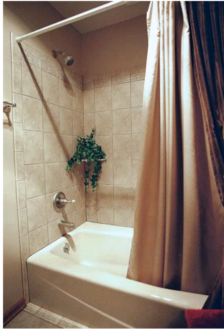
A row of listello tile at the edge of the tub reflects the row high on the shower wall. Satin nickel fixtures with porcelain handles add value to the remodeling with minimum additional expense.

A new soaking tub with satin nickel fixtures and luxurious (but standard) tile was installed. A new, inspired vanity design includes an entablature (all built from simple, standard cabinet components), while dimmable rope lighting and sconces surround an inexpensive elliptical mirrored medicine cabinet (purchased by the owner at a home store).