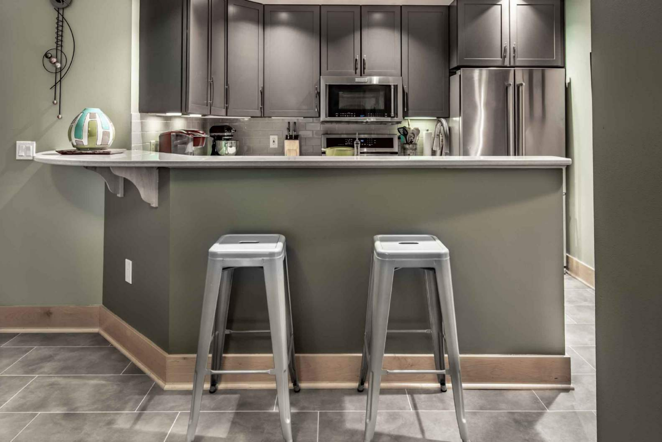
AFTER: OVERALL VIEW OF THE NEWLY UPDATED KITCHEN.