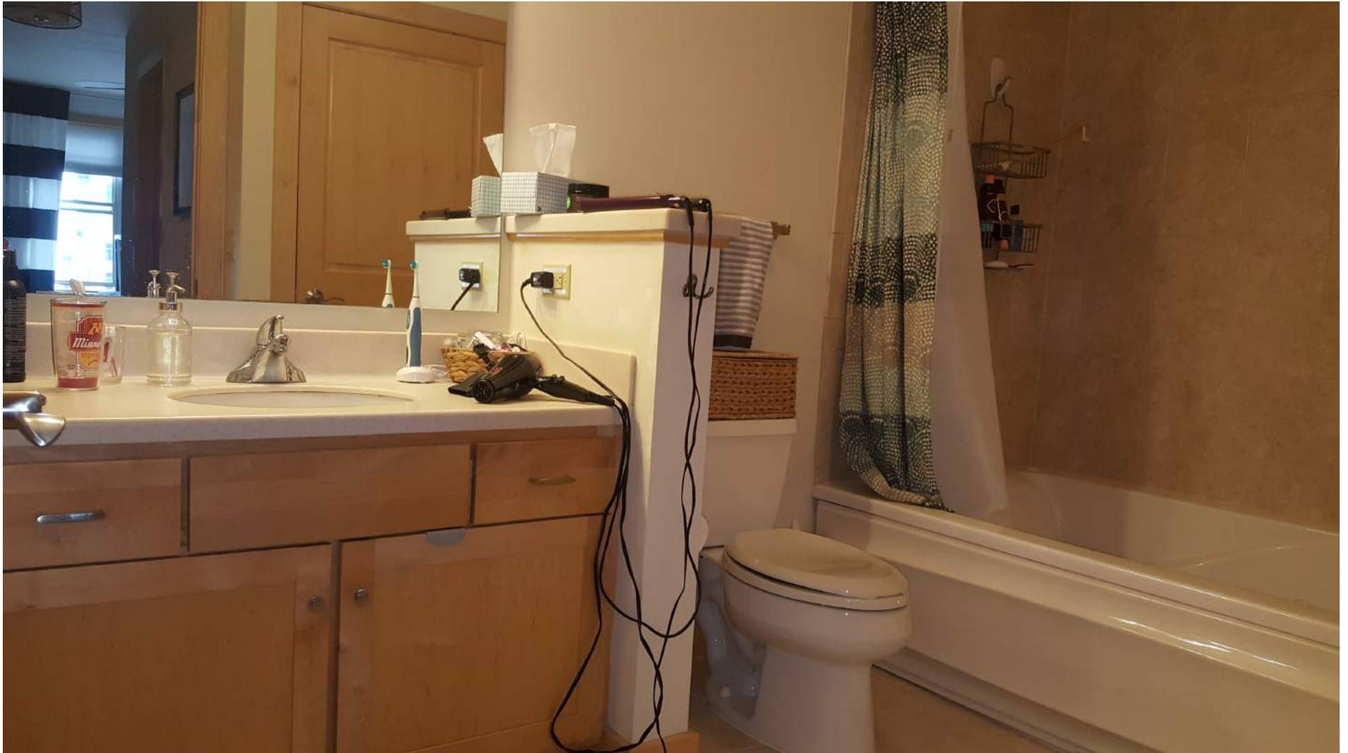
BEFORE: VIEW OF THE EXISTING CONDO WITH SPEC FINISHES.