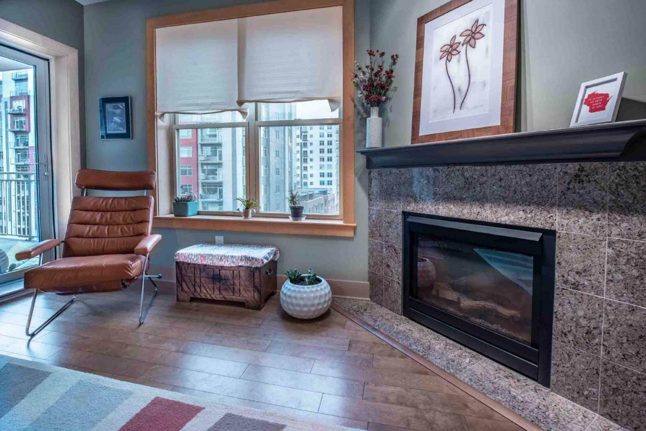
AFTER: VIEW OF THE OPEN CONCEPT LIVING ROOM.