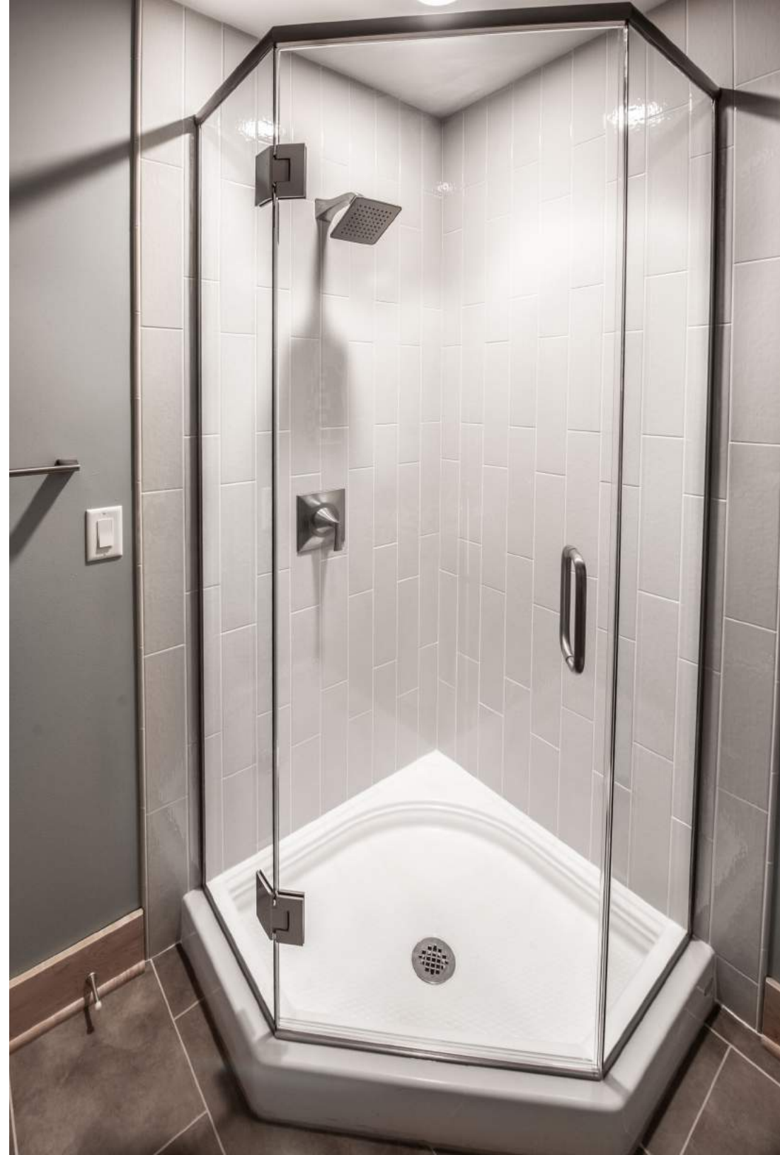
AFTER (RIGHT): VIEW OF UPDATED SHOWER WITH REUSED SHOWER BASE IN MAIN BATHROOM.