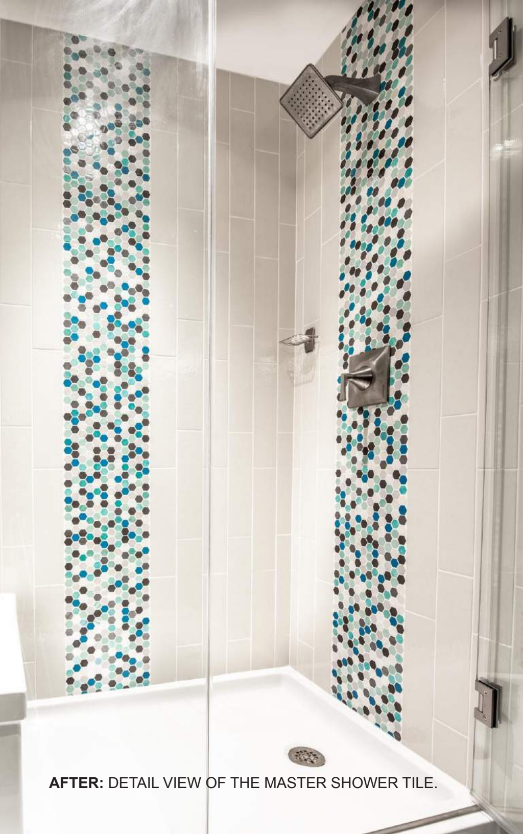
AFTER: DETAIL VIEW OF THE MASTER SHOWER TILE.

The maple cabinets had grown tired, but were still in good condition. The kitchen countertops, however, had chips, stains, and were not the style the owner preferred. For “green” as well as budgetary reasons, the kitchen cabinets were painted and fitted out with new accessories, providing new beauty and functionality. The bathrooms were a larger overhaul that gave the entire space a facelift as well as personality.