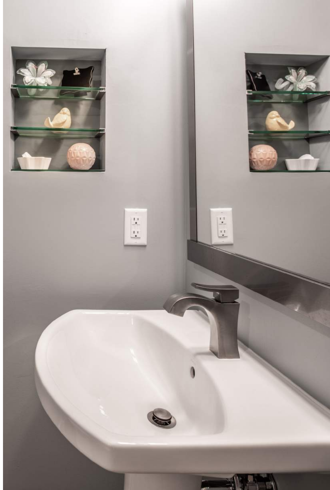
AFTER: A NEW PEDESTAL SINK IN THE MAIN BATH UPDATES THE LOOK AND PROVIDES ADDITIONAL FLOOR SPACE.