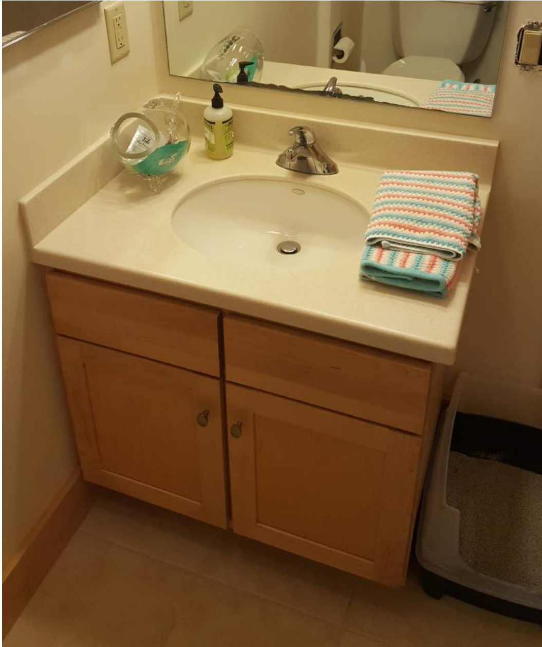
BEFORE: DETAIL VIEW OF THE MAIN BATH VANITY (BELOW) AND SHOWER UNIT (RIGHT).