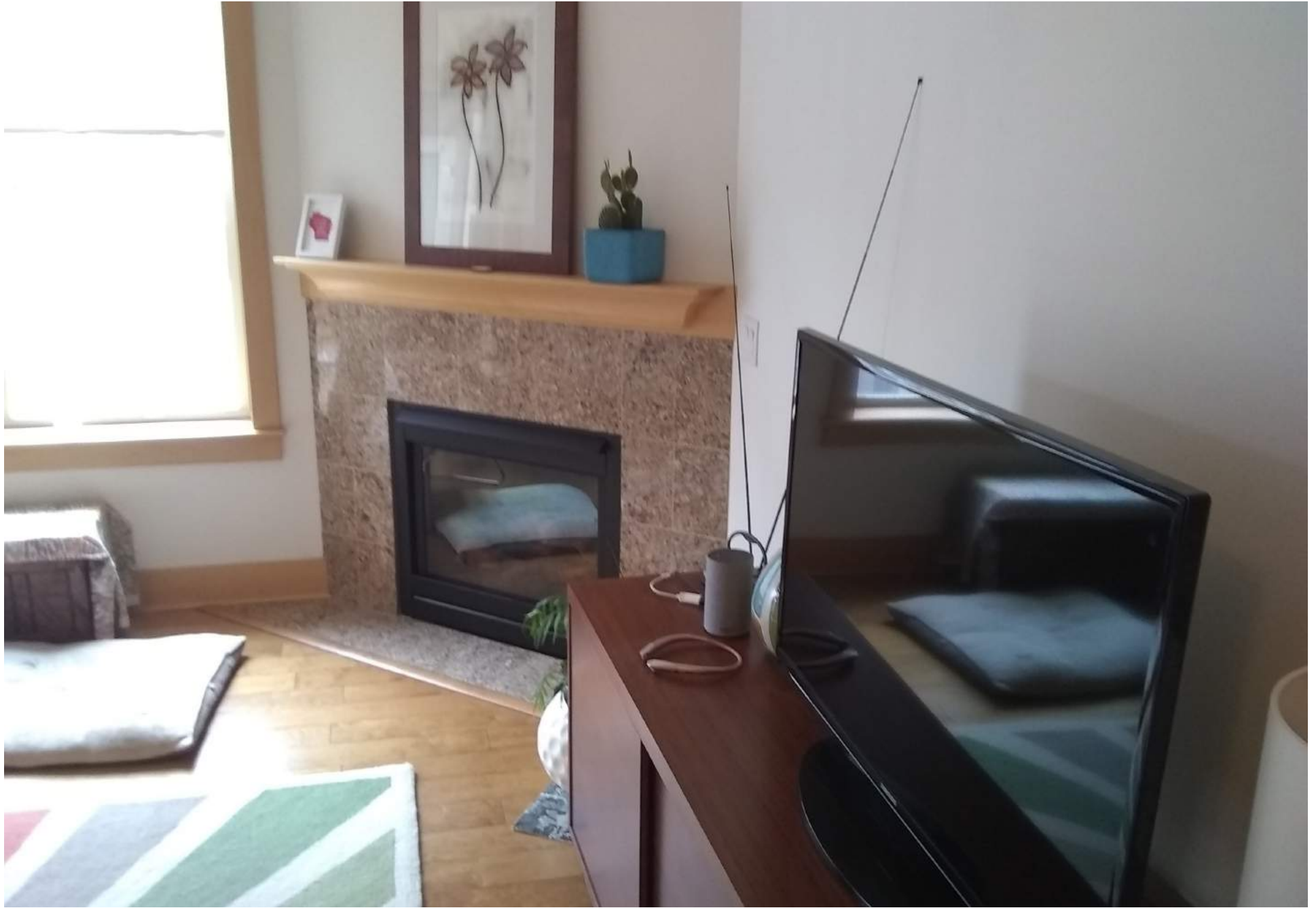
BEFORE: VIEW TOWARD THE EXISTING FIREPLACE.