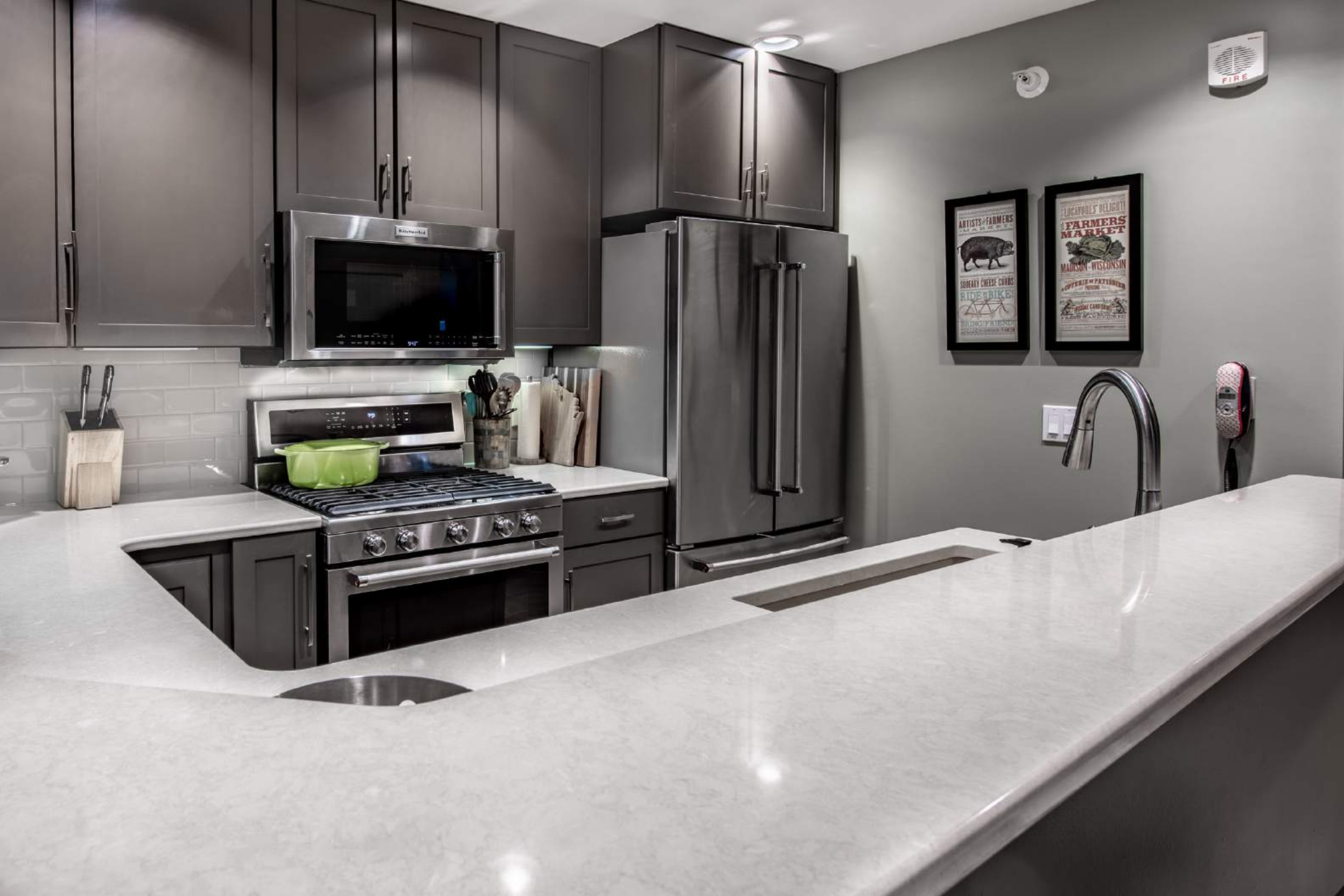
AFTER: VIEW OF THE KITCHEN.