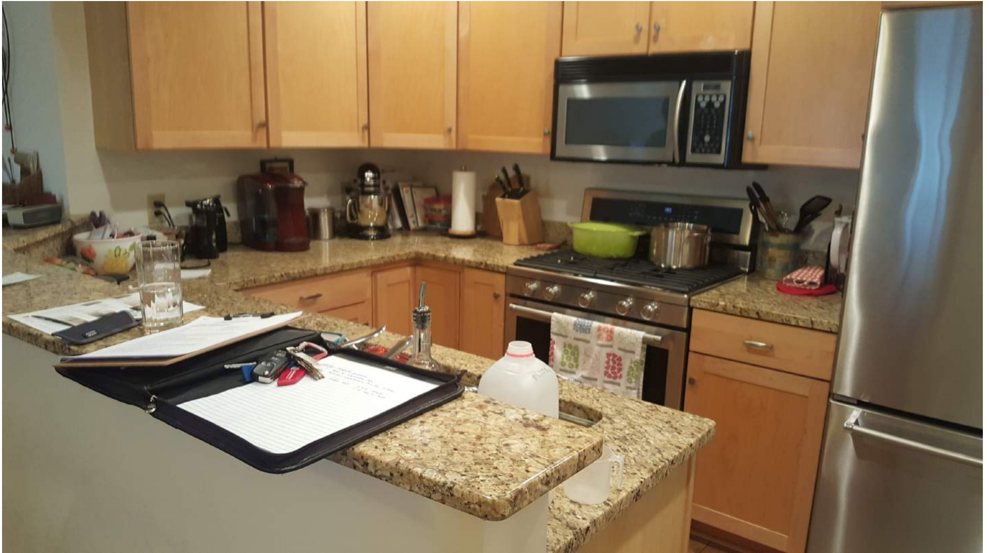
BEFORE: VIEW OF THE KITCHEN. MAPLE CABINETS AND CHIPPED TAN GRANITE.