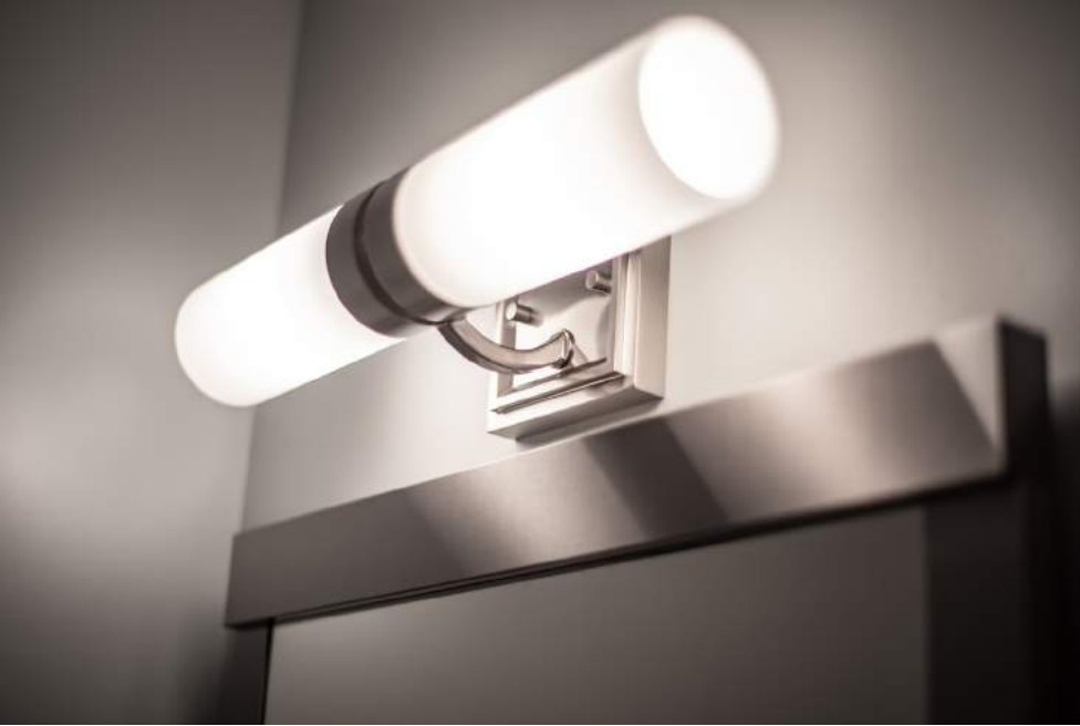
AFTER (ABOVE): DETAIL OF NEW LIGHT FIXTURE IN MAIN BATHROOM.